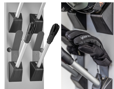
SOLID METAL GLOVE ATTACHMENTS