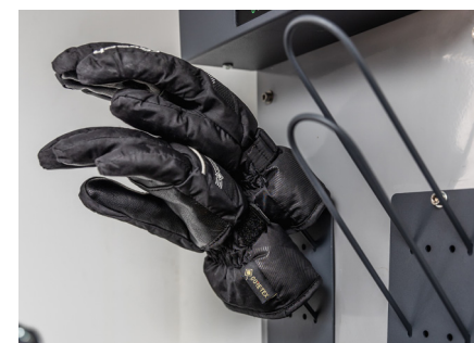
WIRE METAL GLOVE ATTACHMENTS